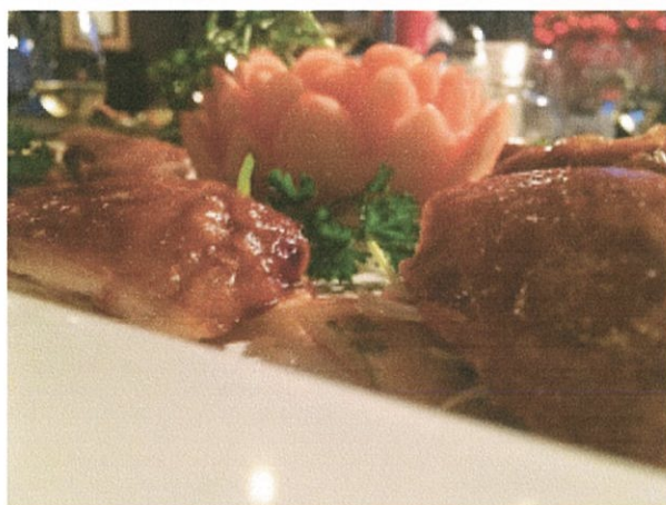
Roasted Duck on Scallion Pancakes

The menu offers typical "Chinese-American" fare: sesame, orange, and General Tso's chicken, egg drop soup, and egg rolls. But a keen observer will head straight for the House Specialties: Northern style duck with steam buns, squid with sour cabbage, Korean pancakes, and more.