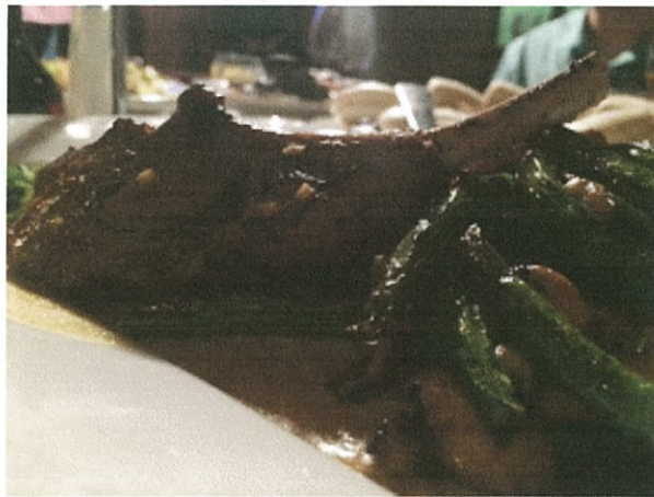
Tamarind Marinated Rack of Lamb with Jalapeno Mint Glaze

Everyone agrees the food is exceptional, but Lucky Palace's reputation was built on its highly curated selection of wines. They have more than 250 to choose from.